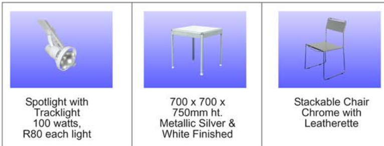
Spotlight with Tracklight 100 watts, R80 each light